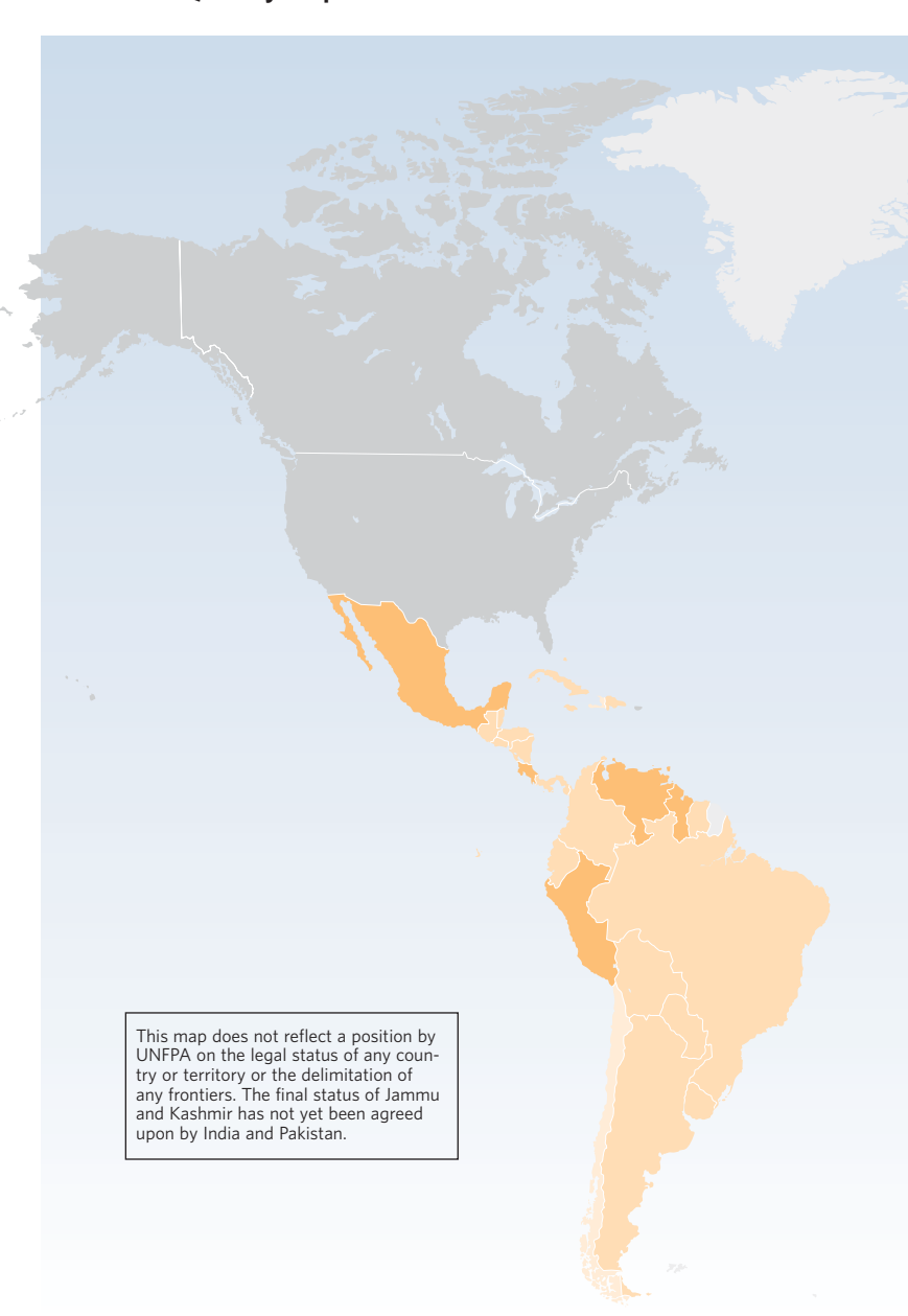
MAP 1 Measures Taken by Countries to Increase Access to Quality Reproductive Health Services

to provide certain services, including the insertion of inter-uterine contraceptive devices, injectable contraceptives and cervical screening.