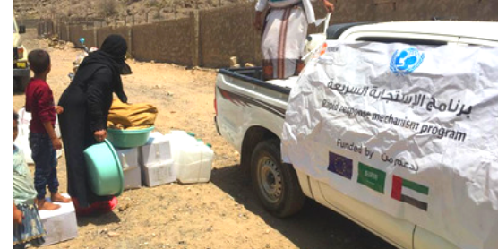
Distribution of RRM kits among displaced families in Al Dhale'e and Sana'a.