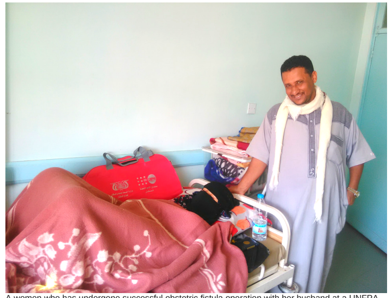
A women who has undergone successful obstetric fistula operation with her husband at a UNFPA-supported fistula unit