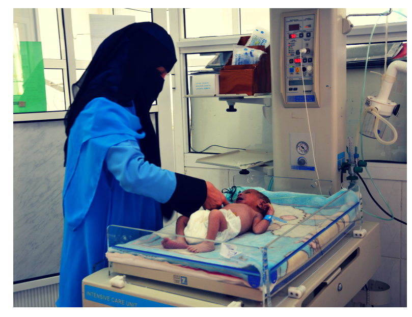
UNFPA supported maternity ward in Ibb