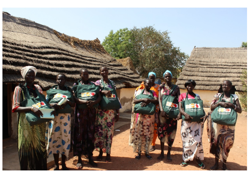
A group of women and girls of reproductive age who received dignity kits in Bentiu town.

In UN House PoC, Juba, 19 people (9 females and 7 males) GBV field officers were trained on GBV Basic concepts and referral path ways and community mobilization techniques. Advocacy is ongoing with the WASH clusters to increase water points and supply in PoC 3 to reduce risks of GBV to women and adolescent girls who are queuing for longer period and until dark to collect water and are experiencing harassment