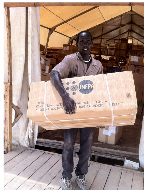
Male latex condom being placed in Health Cluster warehouse in Malakal before distribution.

UNFPA trained 12 Traditional Birth Attendants (TBAs) and is partnering with them to encourage more mothers in the PoCs and around Bentiu town to attend ANC clinics.