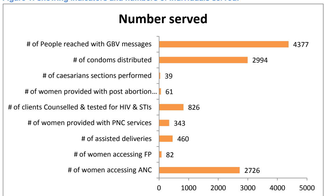
Figure 1: showing indicators and numbers of individuals served:

The table below summarizes selected indicators of service delivery for the reporting week.