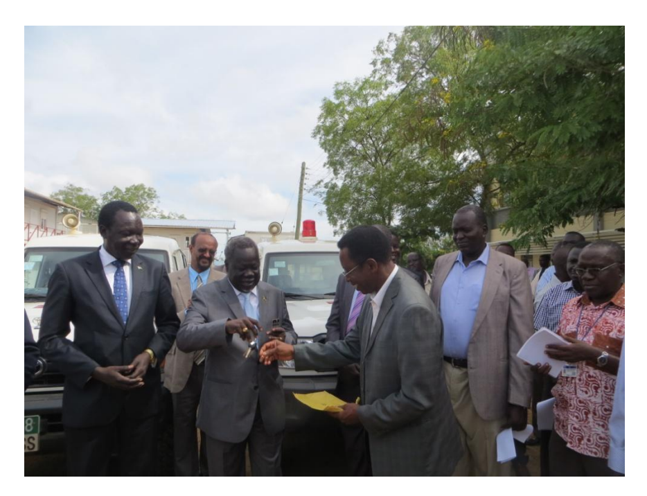
UNFPA Country Representative hands over the keys of two ambulances to the Ministry of Health.

remain early marriage and intercourse; pregnant women under 19 years old represent 17% of clients recorded for the first visit in ANC services.