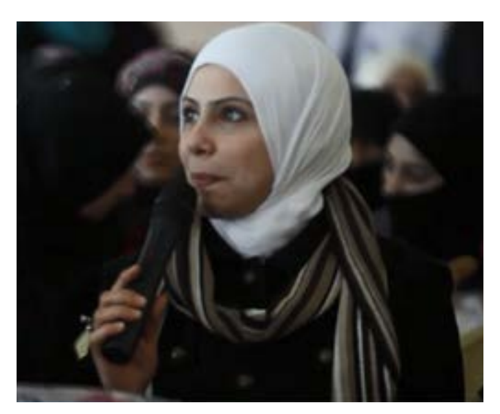
Participants during the volunteerism training held at the Arab Organization for Human Rights.

PRODUCTION OF SUPPORT MATERIALS: As many as 2,000 copies of reproductive health and gender-based violence material were distributed to Syrian refugee youth in Greater Cairo.