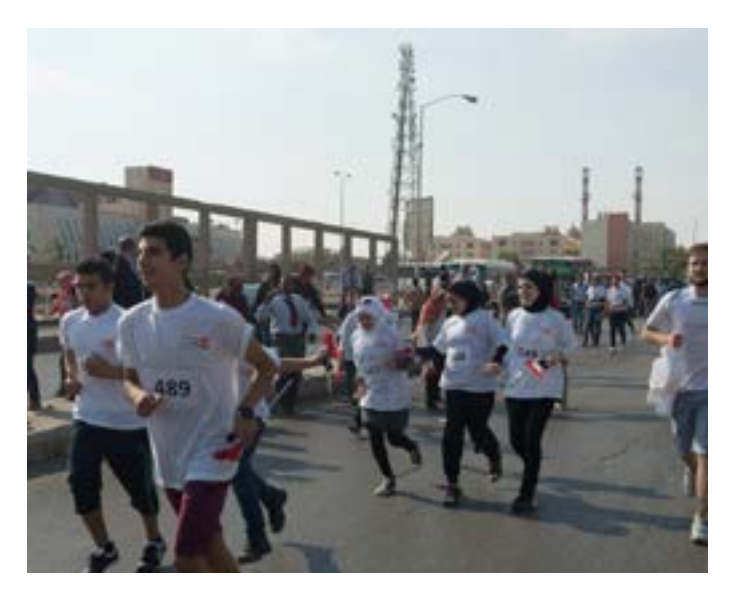
Syrian youth refugees participating in a marathon during the Sports Day in 6th October City in Egypt.