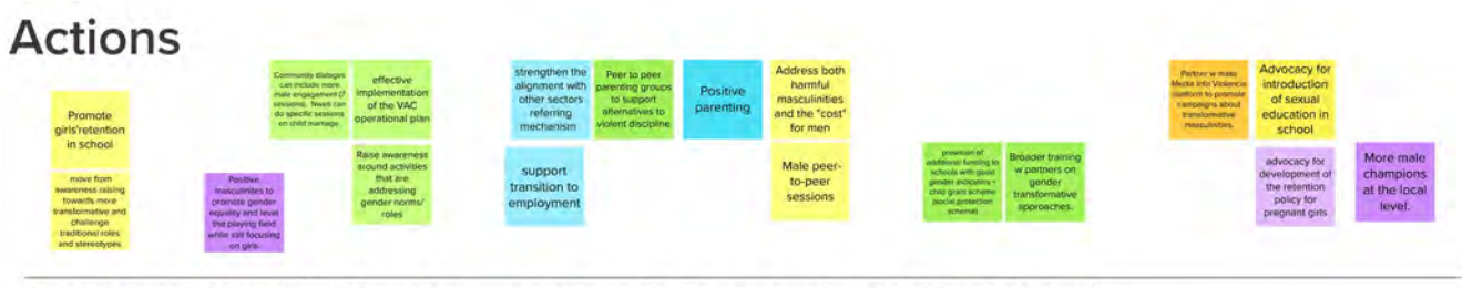
Figure 2. Mural on brainstorming of actions

Which of these actions will shift power and resources towards the most marginalized girls and children?