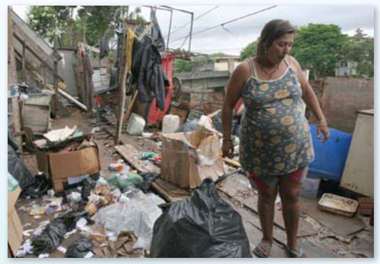
Carina Wint / UNFPA

Mental, physical health and social conditions are three vital strands of human life that are deeply interdependent and interconnected. The prevention and treatment of mental health problems is not only critical to general well-being, but also necessary to prevent problems relating to sexual and reproductive health.