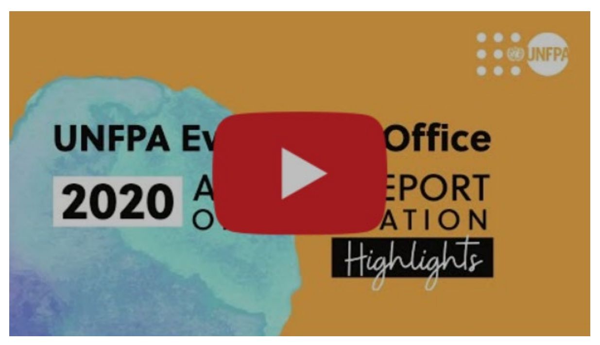
Watch key highlights of 2020 Annual Report on evaluation at UNFPA